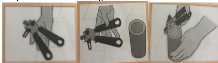
Sumber: Pathway to English For SMA Grade XII Erlangga